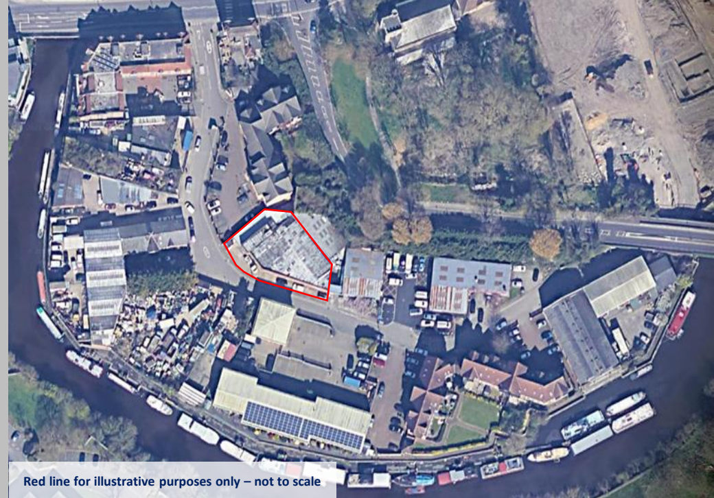
Red line for illustrative purposes only – not to scale

Strictly through prior arrangement with sole agents Vokins.